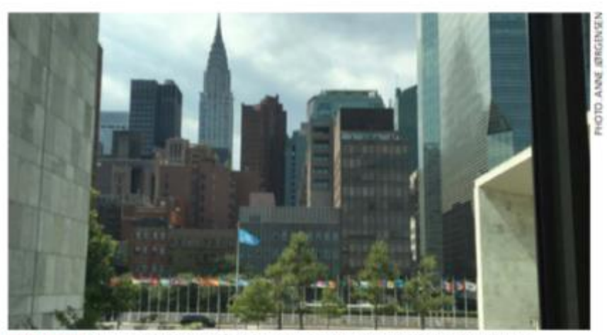
NEW YORK: The establishment of the new UN-GGIM subcommittee on geodesy provides stability and longer-term planning for the GGRF.

"The establishment of a permanent subcommittee is a significant milestone for global geodesy. It sends a very